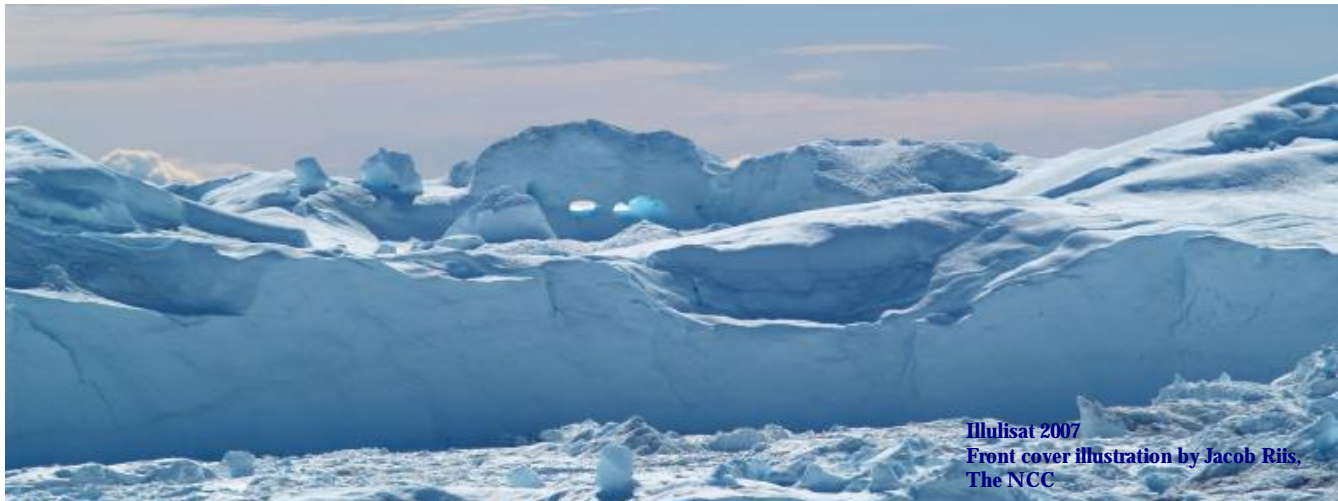
Illulisat 2007 Front cover illustration by Jacob Riis, The NCC