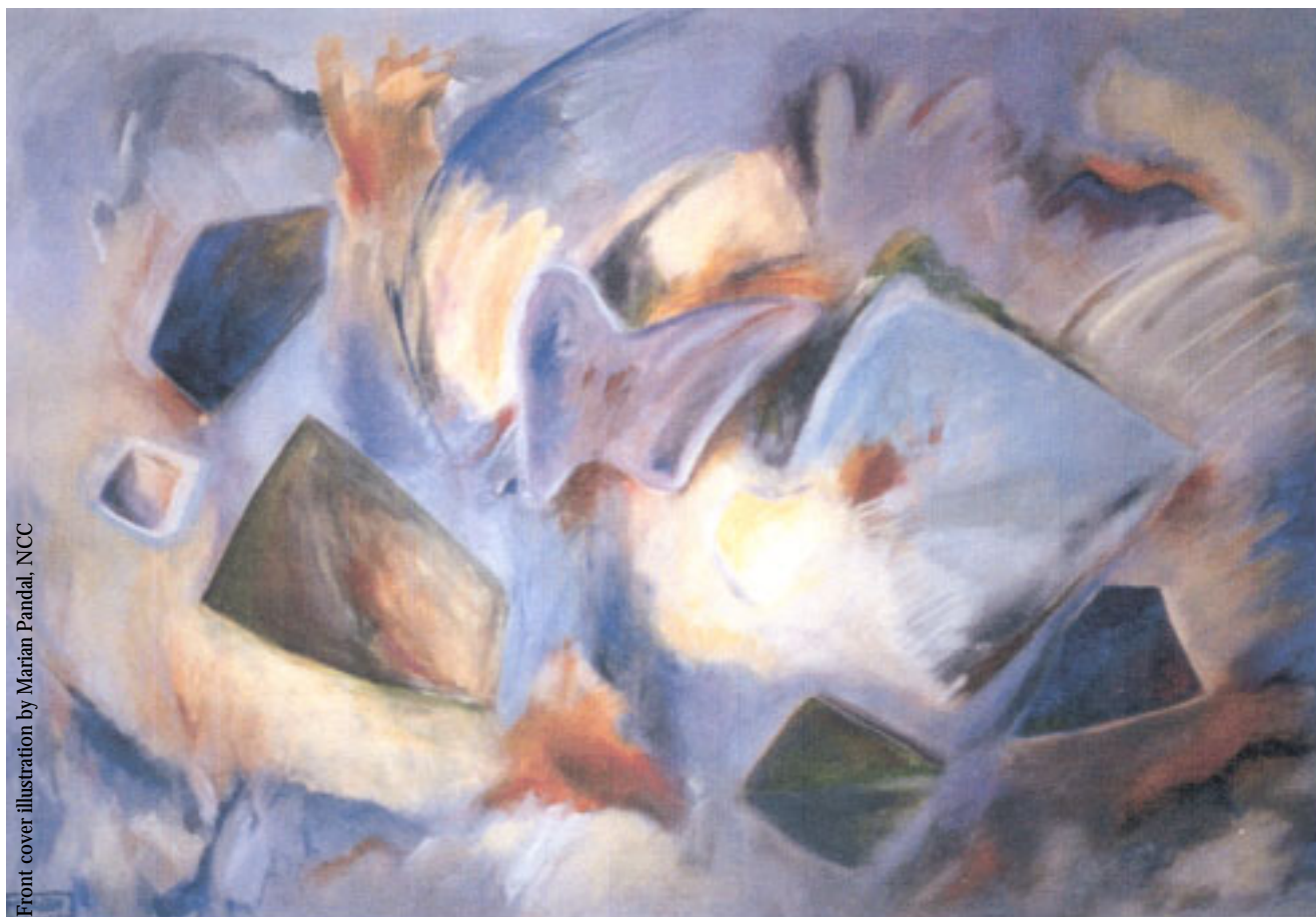
Front cover illustration by Marian Pandal, NCC